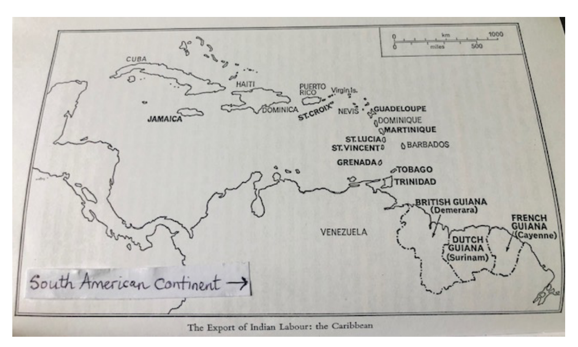
Image 1 – The Export of Indian Labour in the Caribbean (Tinker, 1993, p.114)

In 1966, the country gained independence, renaming itself Guyana and to this day remains part of the British Commonwealth. British Guiana (now Guyana) is positioned on the northern coastline of the South American continent (see Image 1). While not physically a Caribbean island, Guyana is nevertheless associated with the Caribbean West Indies due to its proximity and past colonial connections with other nearby parts of the British West Indies.